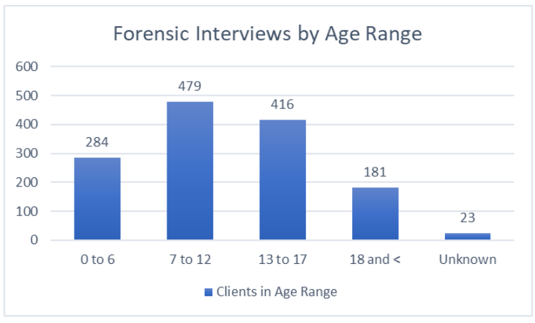
District 4 —Sagadahoc, Knox, and Waldo Counties: This past November, the Midcoast Children's Advocacy Center (MCAC) celebrated its 2<sup>nd</sup> operational year. In 2019, the MCAC served 153 child clients, in 383 separate contacts over a total of 600 hours. 44 of the families seen were connected to a trained advocate from Sexual Assault Support Services of Midcoast Maine.

In the last two years, each of the 140 families who walked through their doors was greeted by a friendly, trained advocate who gave them a tour of their child-centered space. Each of these 268 children was interviewed in a trauma-informed way while their caregiver(s) met with a trained advocate who provided emotional support and resources. Every family was offered referrals to services such as mental