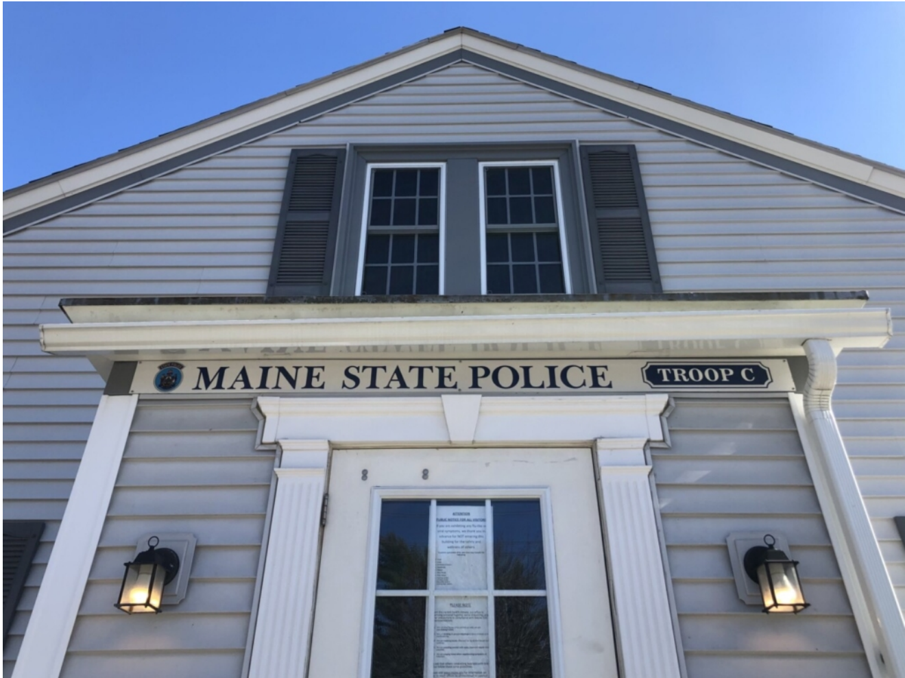
The Maine State Police Troop C barracks in Skowhegan.

The state police is not an outlier in failing to include details about officer misconduct in its discipline records. When the BDN previously examined hundreds of discipline records kept by the state's 16 county sheriff's offices, the newspaper found that many left out specific descriptions of what police and corrections officers did wrong, especially when the punishments were more severe .