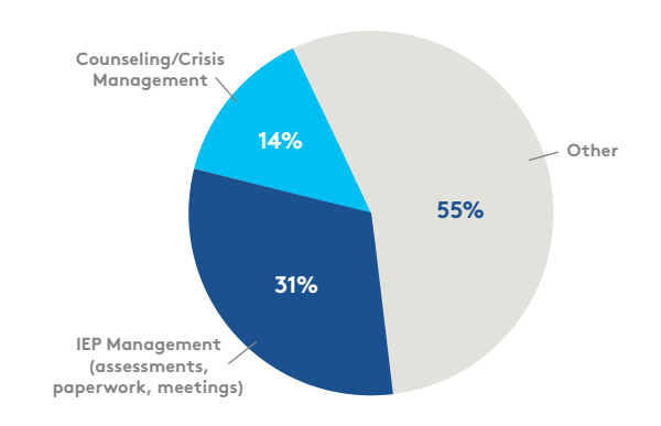
School psychologists on average spent just 14% of their week counseling students