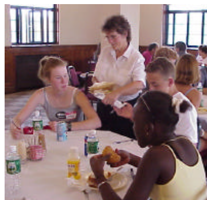
Lunch break at the Criminal Justice Academy meeting in August

The first day of the meeting was held at the Maine Criminal Justice Academy in Vassalboro, Maine. Since it was anticipated that few of the members would know one another initially, a decision was made prior to the first meeting to include an all-day orientation session as part of the first meeting. The orientation session was facilitated by the Hurricane Island Outward Bound School and was extraordinarily successful in building strong relationships among the Council members, in assisting them in better understanding the purposes of the Council, in learning about problem solving methods, leadership techniques and in beginning the process of identifying issues that were of concern to them.