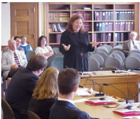
State Supreme Court Justice Leigh Saufley discussing issues with the Council

Following those votes, the Council resumed its discussion of the issues identified the previous day as key issues for youth in the State. That discussion included an opportunity to discuss the role of the press in the policy process with Selena Ricks, a reporter with the Portland Press Herald, and Greg Lagerquist, an anchor and reporter with WGME-TV.