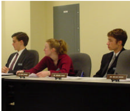
Council members listen to panel discussions in September.

The Council also heard from another young man who told of his long involvement with drugs and alcohol. He told the Council that drugs and alcohol were “the thing to do” in his community. He indicated that it had taken him a long time to realize that he was different from his friends because they could stop and he couldn’t. He had several