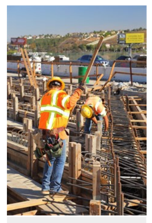
The toll model provides funding to invest in infrastructure.

Would not replacing the fuel tax with the RUC levied at a rate which was equivalent to the average revenue raised, allay any financial concerns?