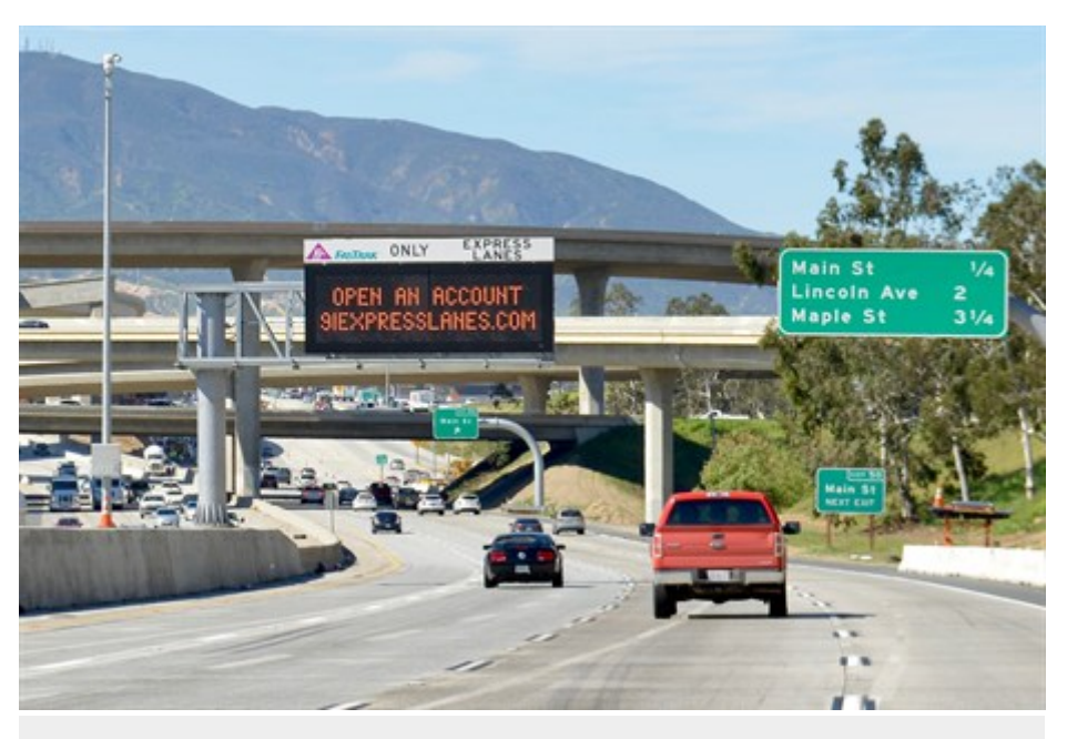
Managed lanes give drivers the choice to pay for assured travel times or face congestion on the free use high

"In my mind, a road user charge represents basic funding in the same way as a fuel tax, and tolls present themselves as a very effective project funding and financing mechanism. But I