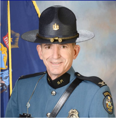
John E. Cote, Colonel

The primary purpose of the Maine State Police is to protect the lives and property of the citizens of Maine and those who visit our state by enforcing motor vehicle and criminal statutes. These efforts are primarily focused on the rural areas of Maine without organized police departments, on the Maine Turnpike and the Interstate System. The Bureau investigates all homicides in Maine that occur outside of the state's two largest cities – Portland and Bangor. The State Police provide a wide array of specialized response teams and support functions for Maine law enforcement agencies. The Bureau operates the Maine