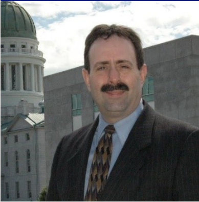
Russell J. Gauvin, Chief

The Bureau of Capitol Police is a law enforcement agency responsible for the safety of the people and the security of the buildings that make up Maine's seat of government. The Bureau was first organized in 1967 by Governor Kenneth Curtis. While Capitol Police officers are based at the Capitol Complex and their efforts are primarily focused on the immediate area, they may take action statewide as needed. Officers take great pride in ensuring the safety and security of state legislators, legislative staff, state employees and the people of the State of Maine. We act cooperatively with other local, county, state, and federal agencies to ensure that we provide the best possible services. Our primary areas of responsibility include the State House, the other State buildings within the Capitol Area campus, and the buildings on the east side of the Kennebec River within the East Side Campus (formerly the Augusta Mental Health Institute). Bureau police officers patrol State owned or controlled properties in Augusta, enforce laws, including parking and traffic regulations, and respond to alarms and other calls for help or assistance on the two campuses. Additionally, we have an office at Riverview Psychiatric Center and provide 24 hour police services to assist staff and individuals who are receiving care.