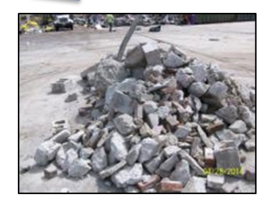
Asphalt, Brick & Concrete (ABC)