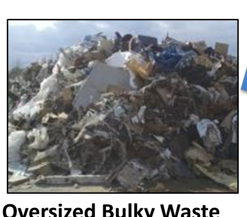
Oversized Bulky Waste (OBW)