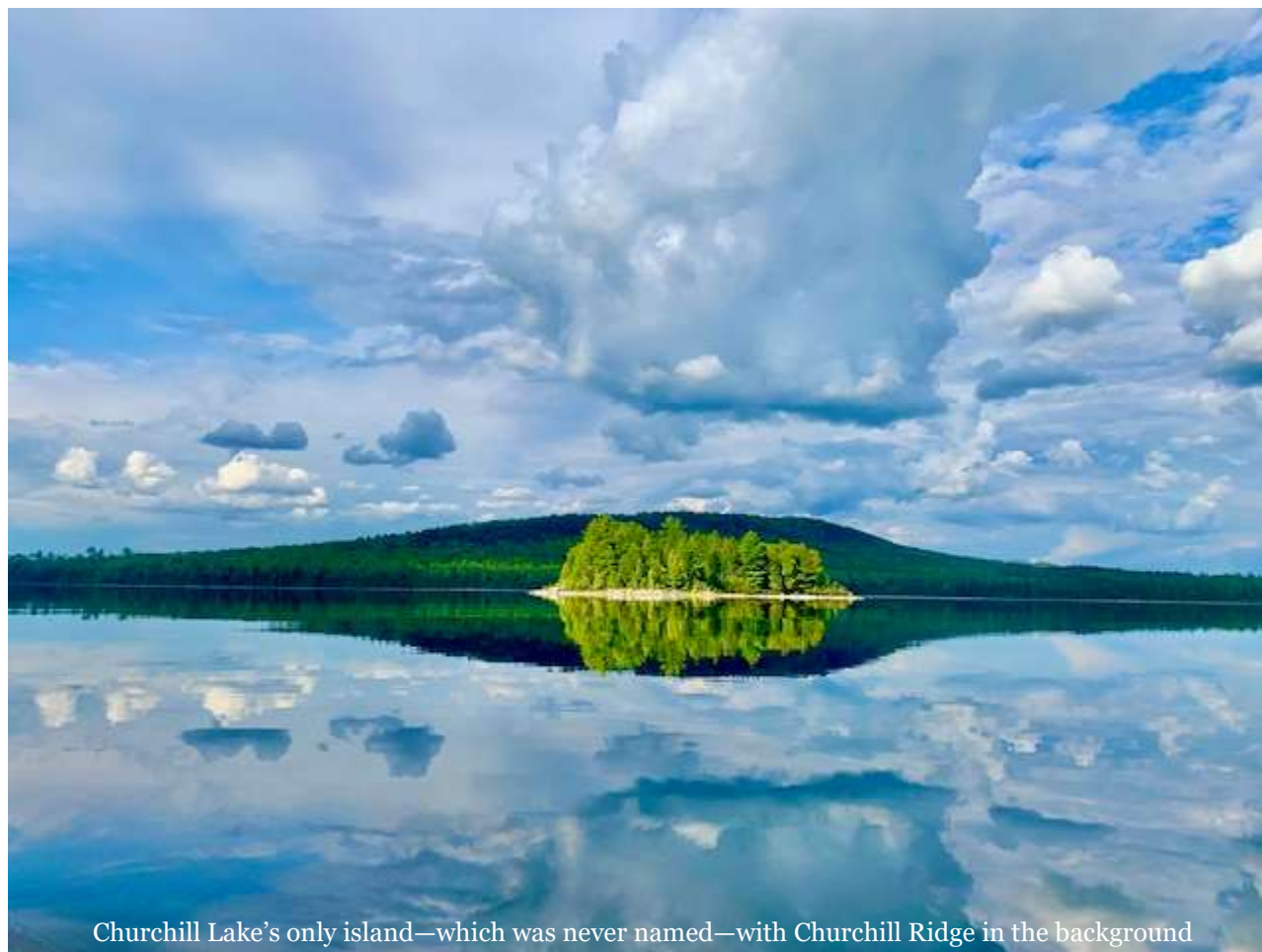
Churchill Lake's only island—which was never named—with Churchill Ridge in the background