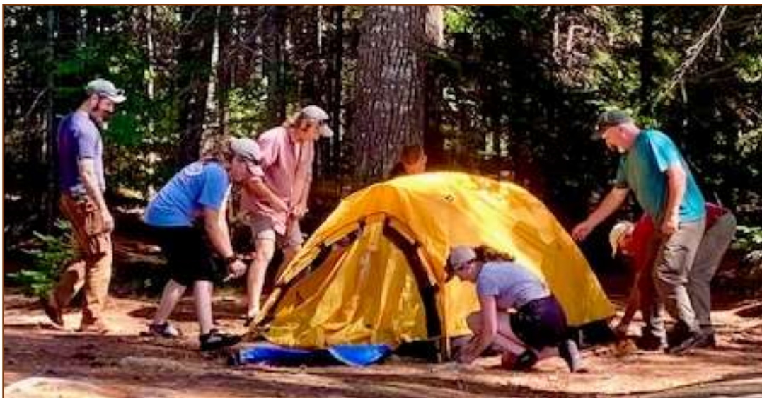
The AWW Rangers at Scofield Point setting up a tent as part of the camping safety training.

The AWW staff spend time every day informing and educating many Waterway visitors on a variety of topics, such as important safety tips, canoe/camping skills, rules and regulations, the history and culture of the AWW, recreational and sightseeing opportunities, and information about AWW flora and fauna.