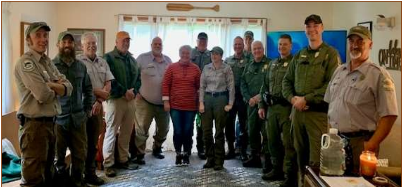
The AWW Team having an appreciation luncheon at Churchill Dam HQ with representatives from the Maine Forest Service, North Maine Woods, and IFW. We are fortunate to be surrounded by great partners – Thank you!