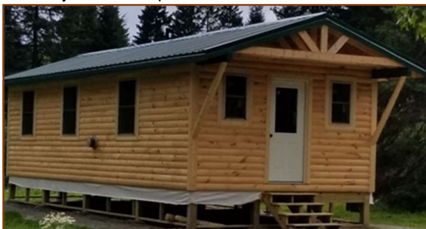
New Farm Brook Cabin at Michaud Farm