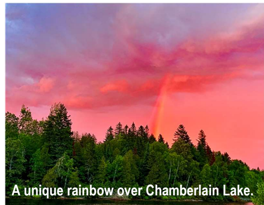
A unique rainbow over Chamberlain Lake.

AWW Donations Account: $5,456.72 was in the Allagash Wilderness Waterway donations account as of June 30, 2022.