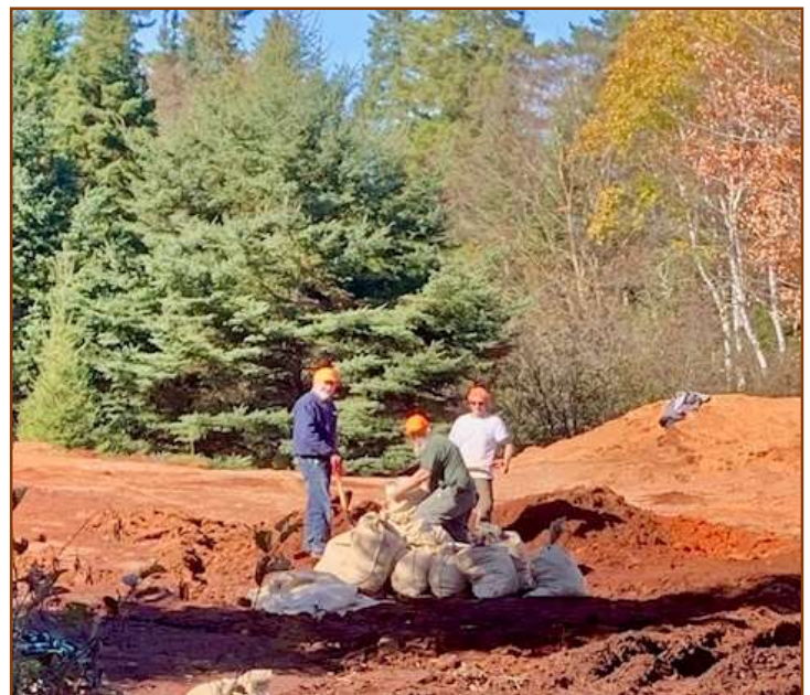
Rangers and volunteers filling burlap bags for leakage mitigation efforts at Telos Dam.