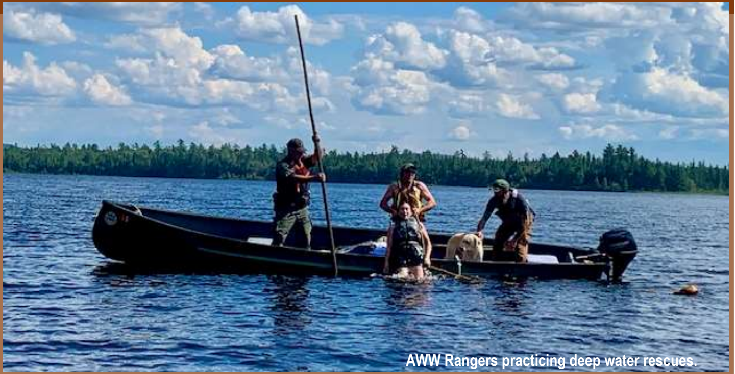
AWW Rangers practicing deep water rescues.